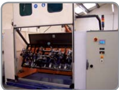
Mig welding robot cell with orbital turntable for welding facia assemblies