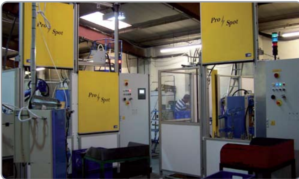
Robot welding cells for BMW mini Airbag covers

Prospot has the capability to design and manufacture robot welding systems for all types of welding applications either using new equipment, refurbished equipment or utilise our customer's own redundant machines to make cost effective solutions.