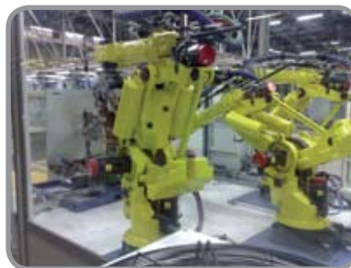
Triple robot cell for welding rear quarter bodyside assemblies