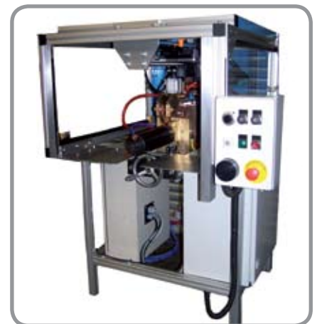
Semi automatic filter seam welder