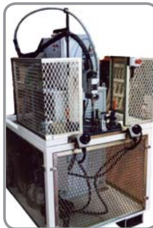
Capacitor discharge stud welding machine