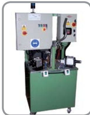
3 Headed spot welder for welding fuel hose necks