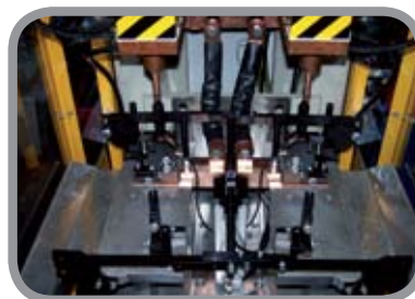
Twin headed spot welder