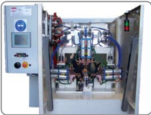
6 Headed multi spot welder

Prospot has the ability to design and build special purpose welding and assembly machines for all types of welding applications including MIG, TIG, SPOT, SPOT SEAM, BUTT, CAPACITOR DISCHARGE and PROJECTION WELDING.