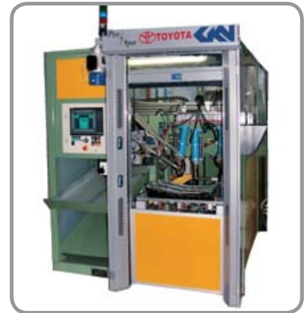
3 Headed multi projection welder with eject station