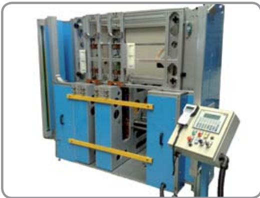
Twin headed projection welding machine with servo controlled fixture for multi component welding