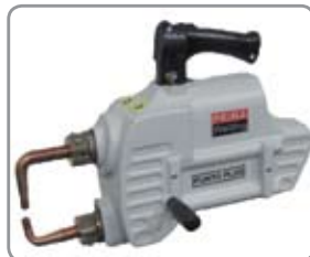
The X gun is available with 20mm cap electrodes or 13mm.

An attachment DPC can be fitted to the X gun to convert to C gun.