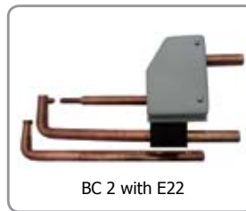
BC 2 with E22