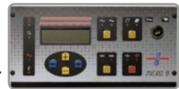
Micro 8 Timer