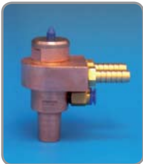
B3 3/4" BSP Thread