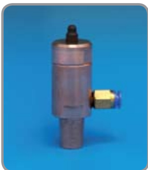
B13 1/2" BSP Thread