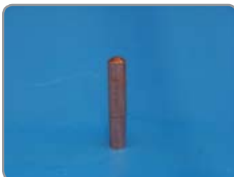
7100916 NO1 MORSE